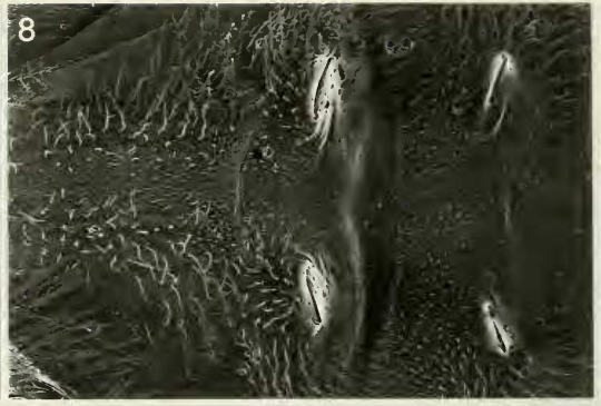
Figs 7-8. Systrophia heinzi sp. n. (male); 7, ventral view of metasoma; 8, projections of S2 and 3.

on marginal zone. Prepygidial fimbria on marginal zone of T5 as well as pygidial fimbria (T6) conspicuously orange. Pubescence of S1-6 yellowish white with short (S6) to medium long (S1-5) hairs.